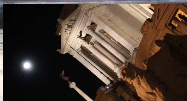
Rome was the scenery of our 5th anniversary in February