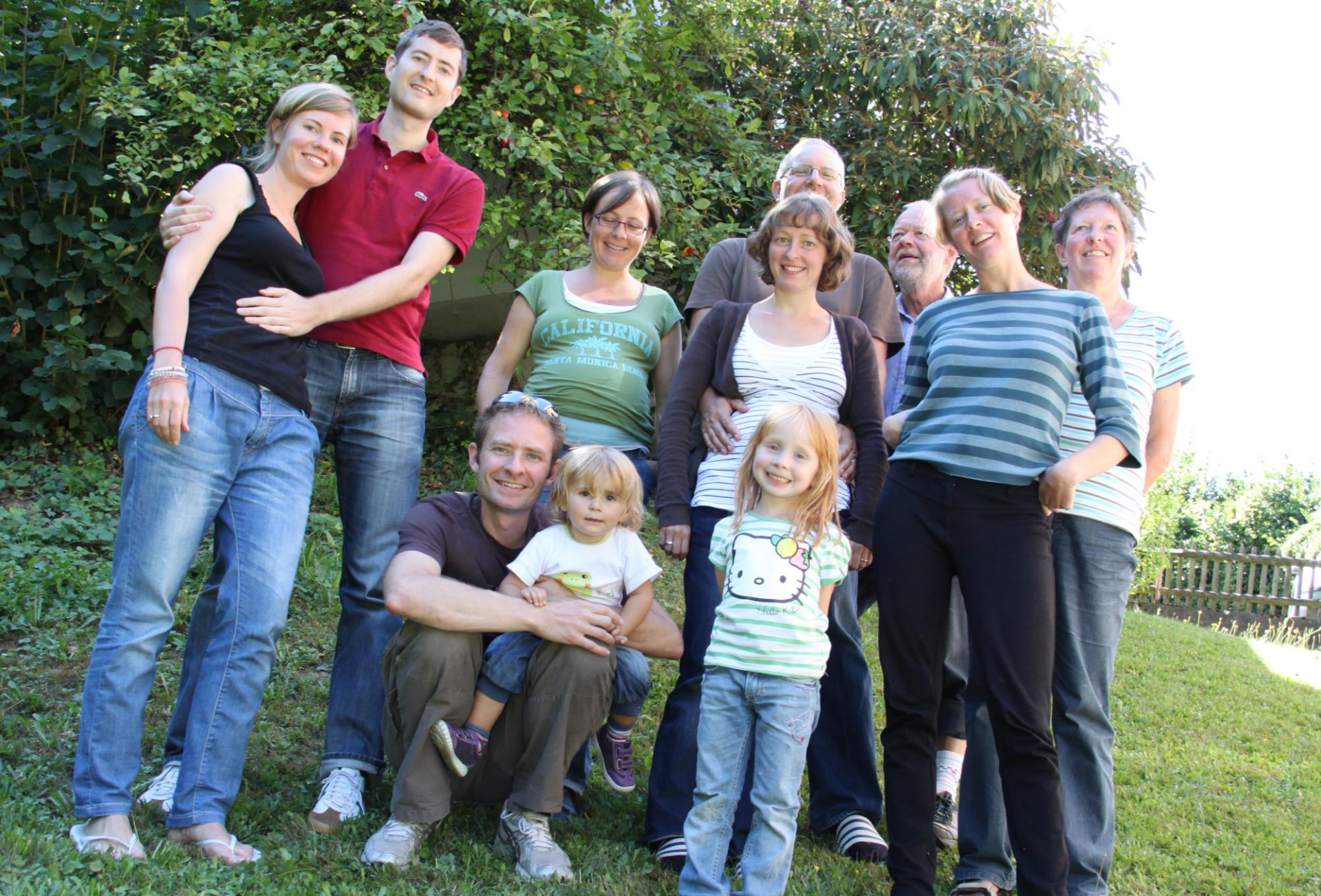
We enjoyed the Frey-family-weekend at lake Neuchâtel