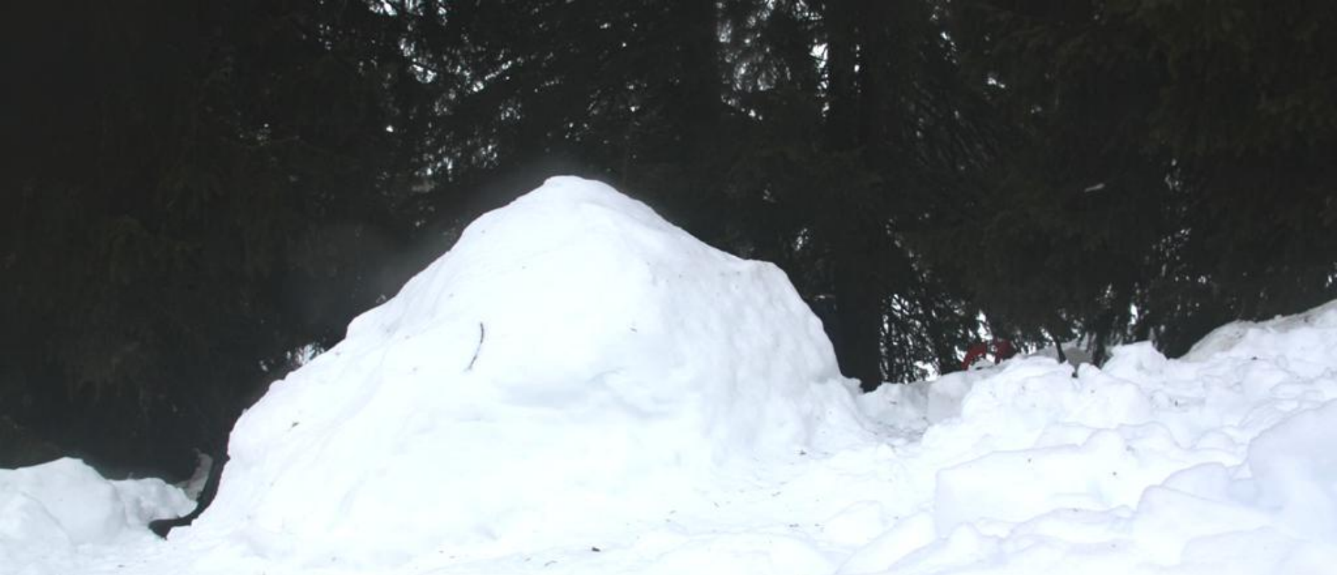
2011 ended chilly but cosy in our own built igloo