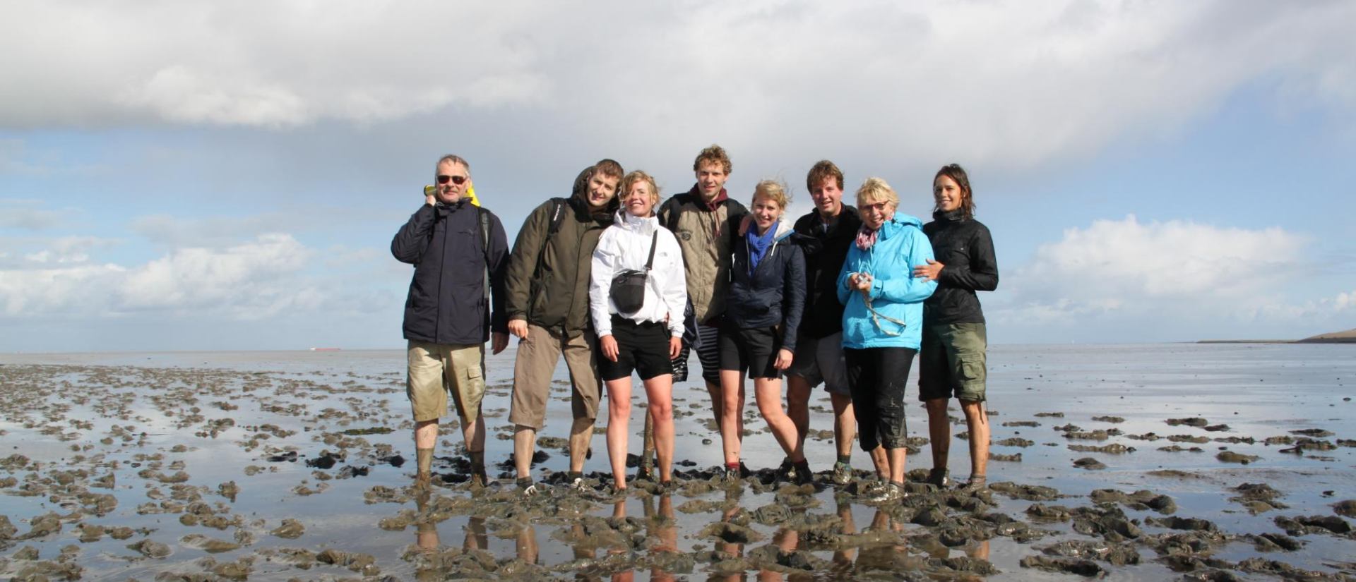
On the Van-der-Heijden-family-weekend in October, we went for mudflat hiking in the IJsselmeer