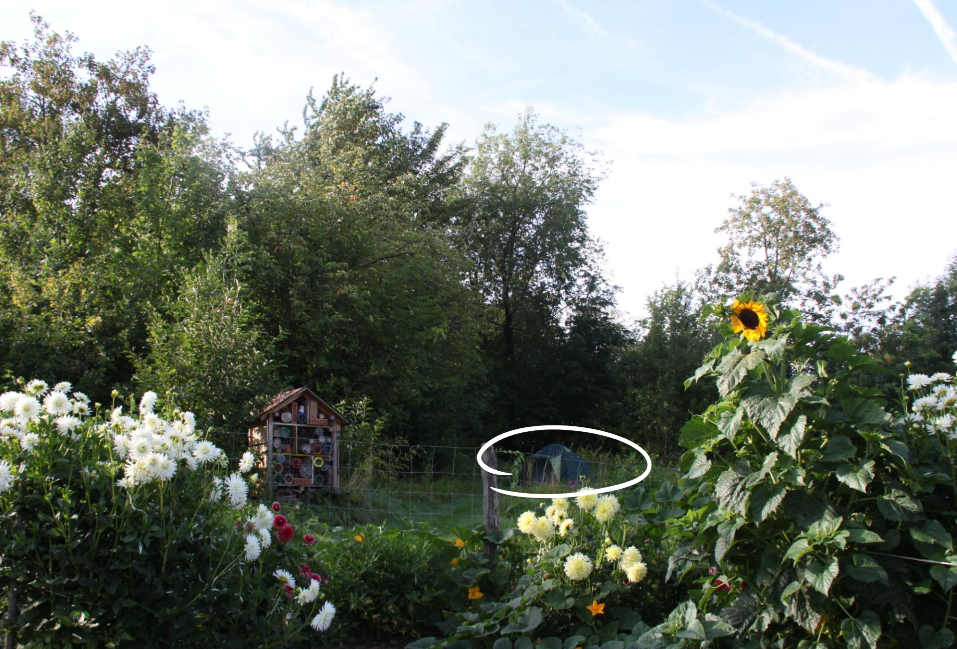
Annemiek's parents came along and we wanted to go camping together. However, due to bad weather, we ended up in Benjamin's parents' garden