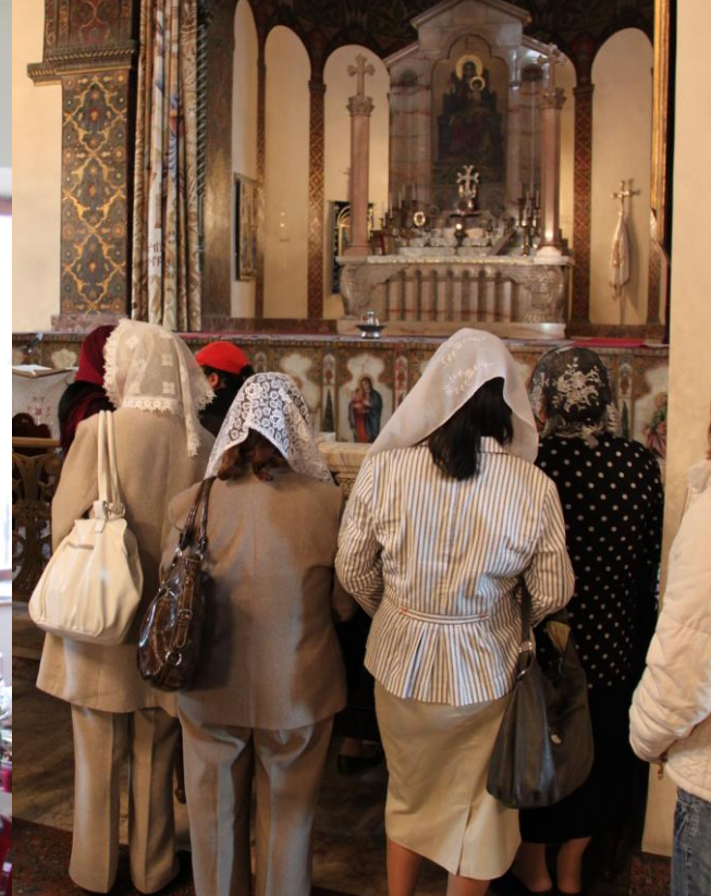
In May we went on holiday to Armenia where fighter jet pilots taught us how to drink vodka, where we rode the longest cable car in the world and where it was easy to have a great time