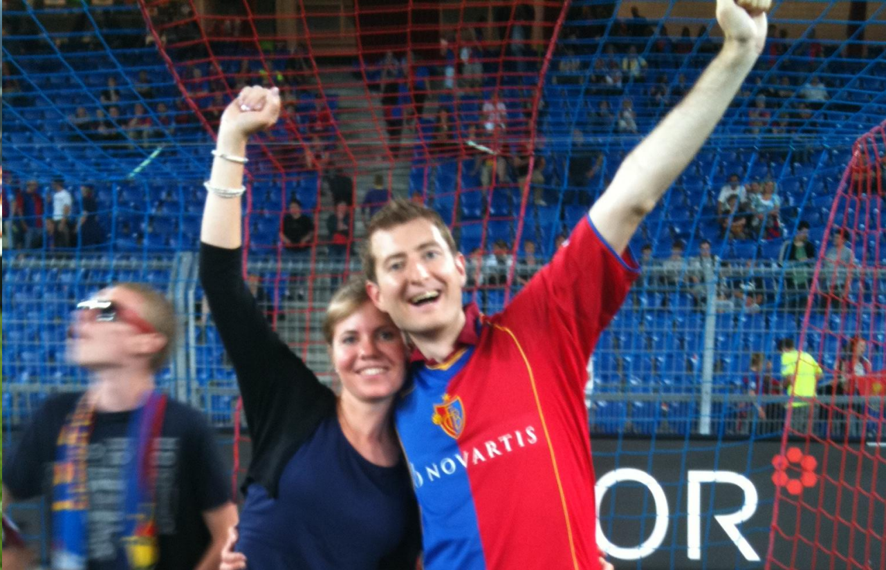
On May 25th we watched FC Basel becoming Swiss Football Champion 2010/11 *sing* Meister, Schwizer Meister, schalalalalalalalala, Meister, Schwizer Meister! *sing*