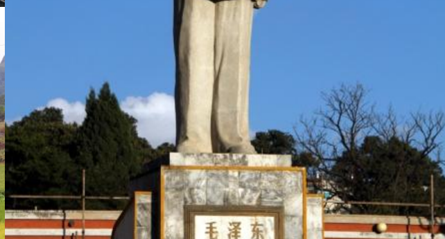
Benjamin went on a memorable vacation to China and since then is convinced that in fact there are at least 3 billion Chinese. They really were all over the place (due to her new job, Annemiek couldn't join)