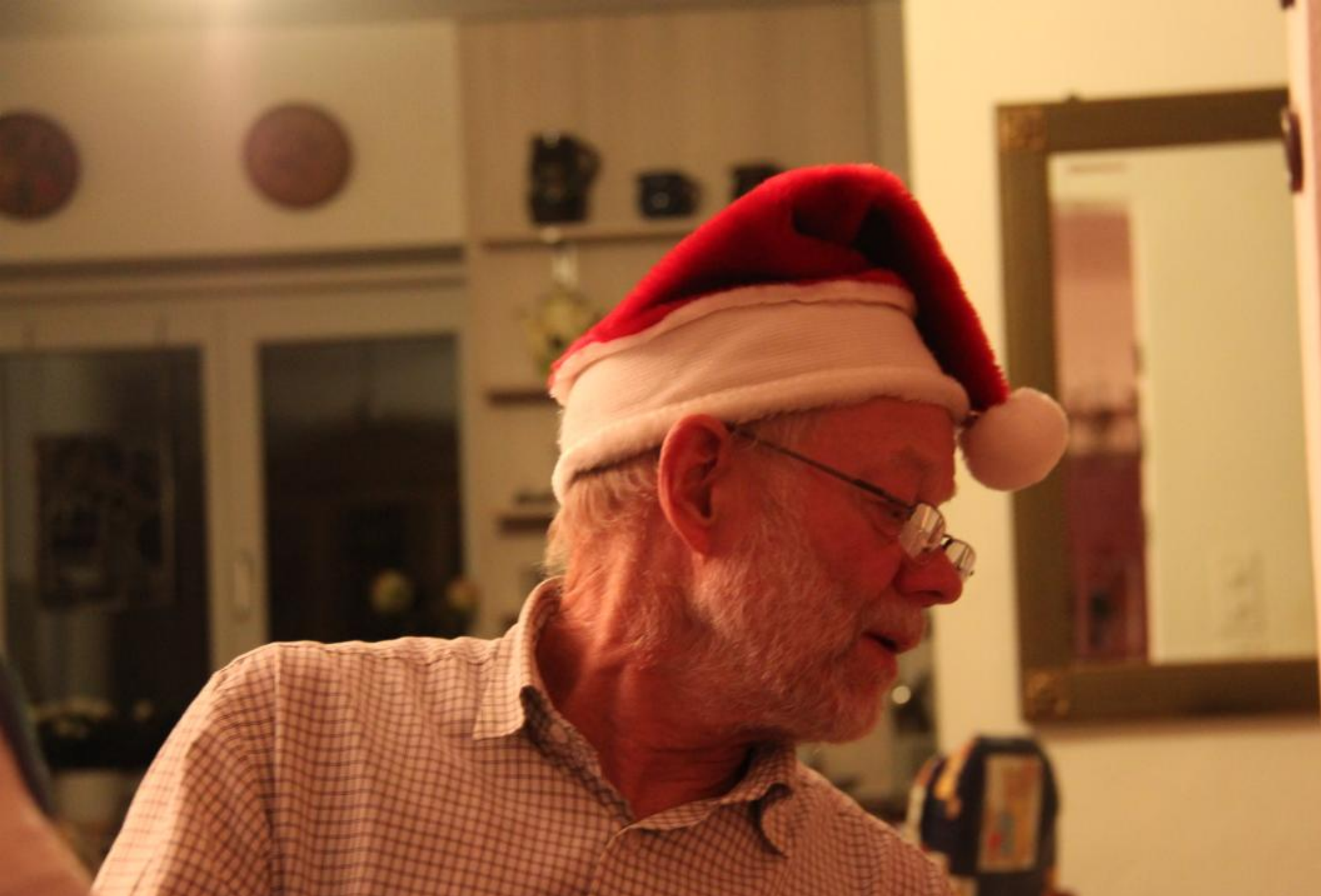
We spent Christmas with our families singing and eating in Switzerland and the Netherlands