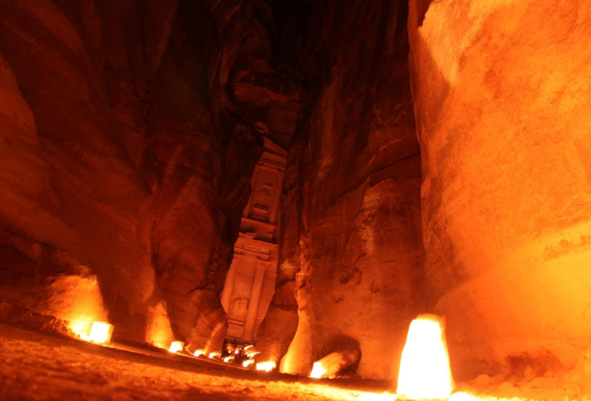
Petra by night