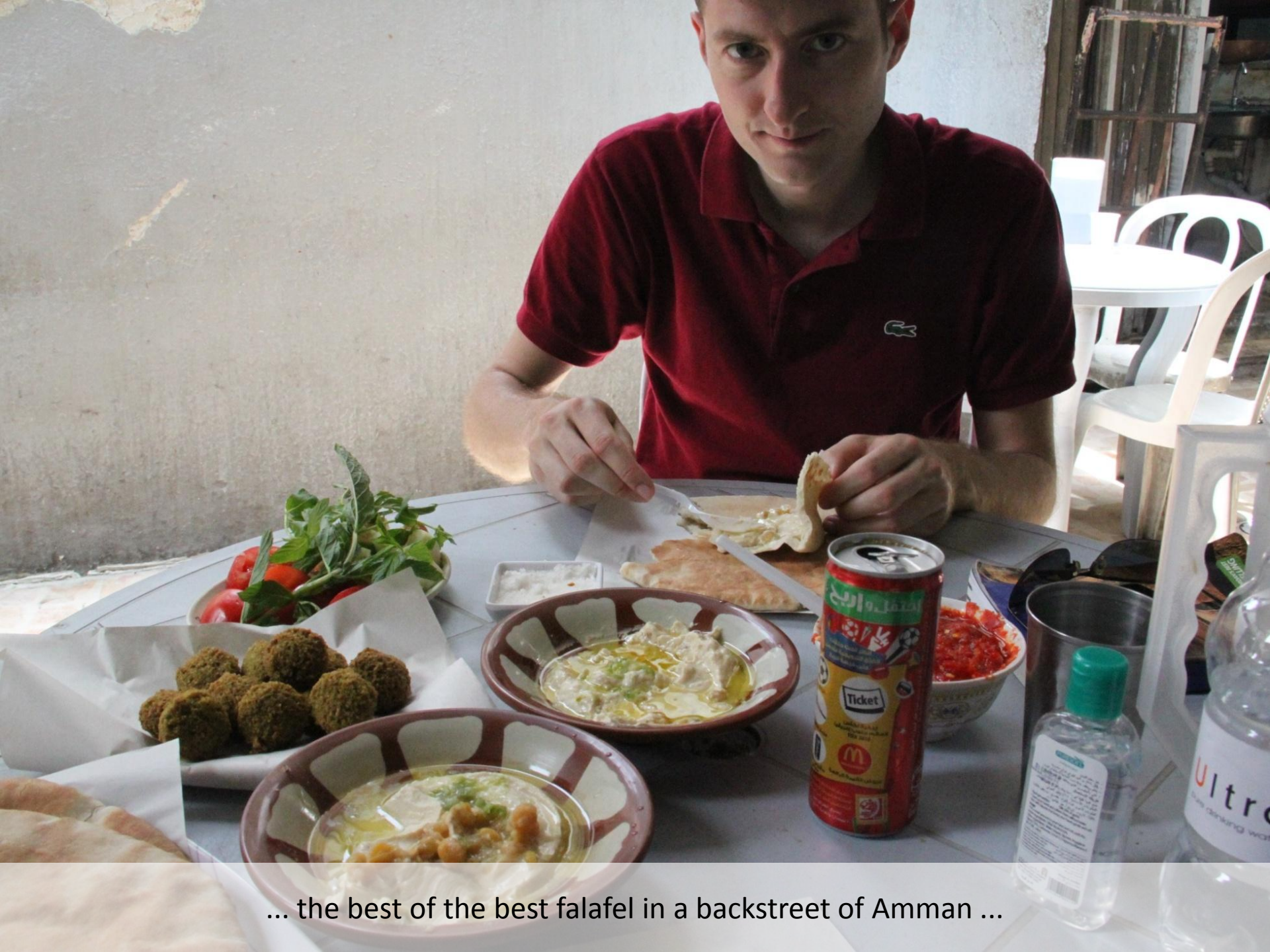
... the best of the best falafel in a backstreet of Amman ...