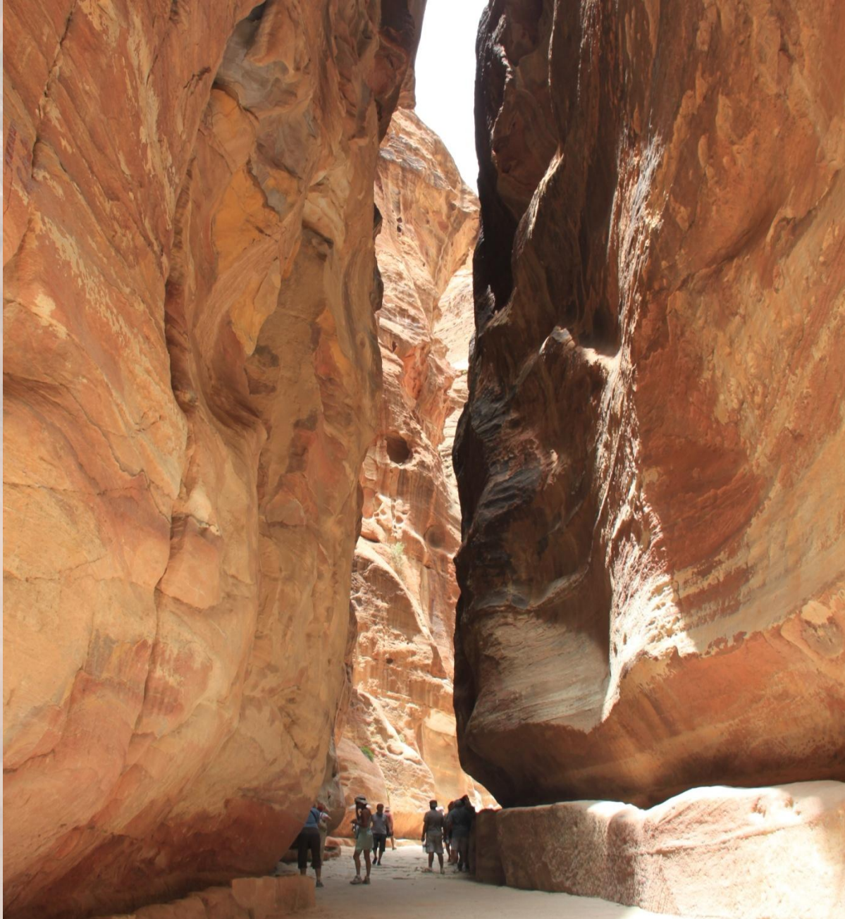
... entering Petra trough the Siq ...