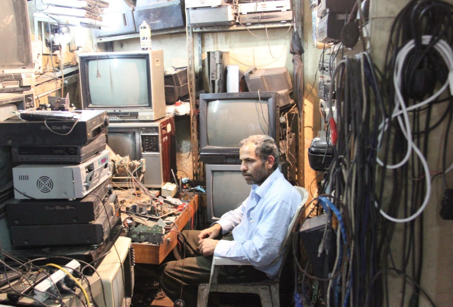
... shopping in Downtown Amman, looking for a new TV for our new flat ...