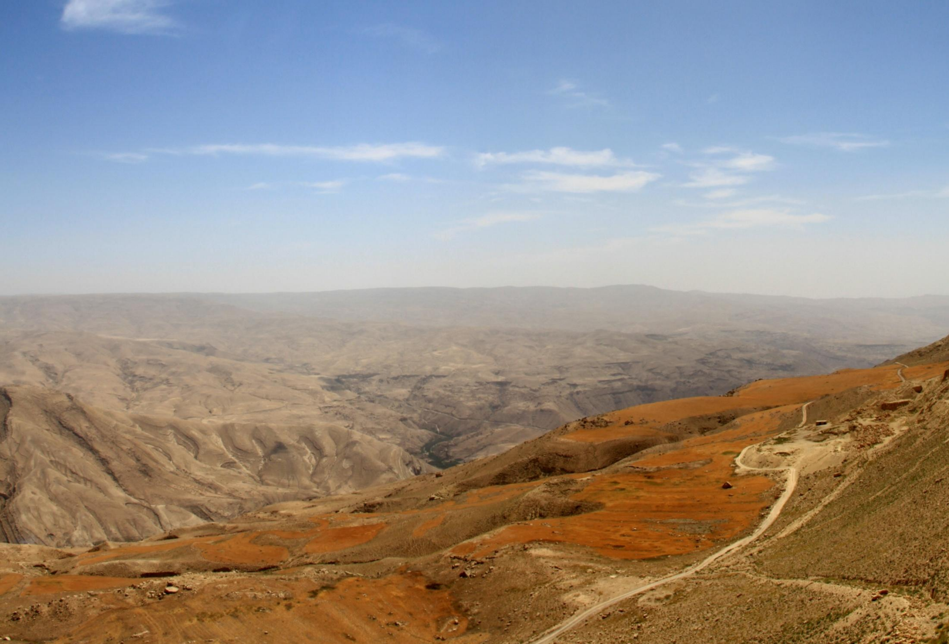
... Wadi Hasa, south of Karak ...