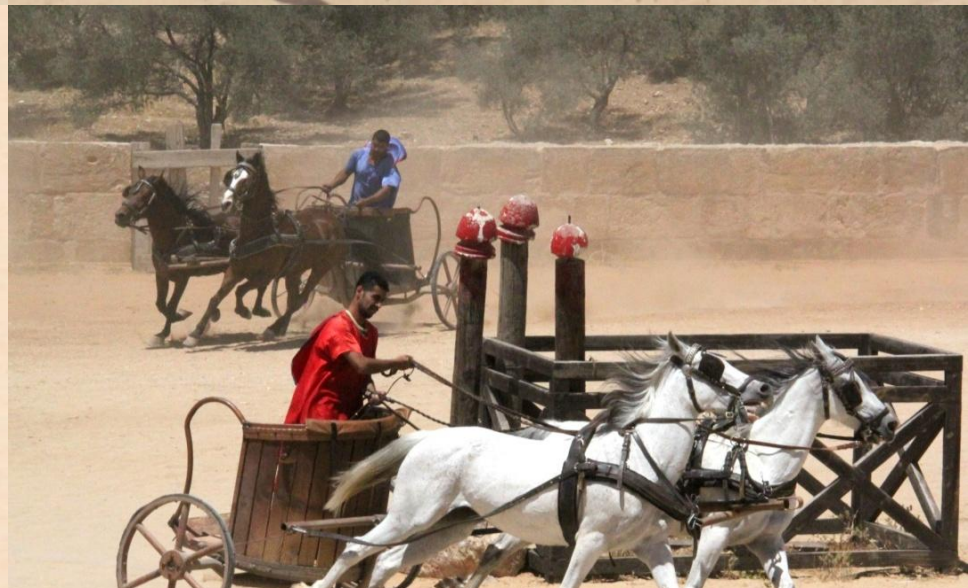
“Panem et circenses” (Bread and circuses)