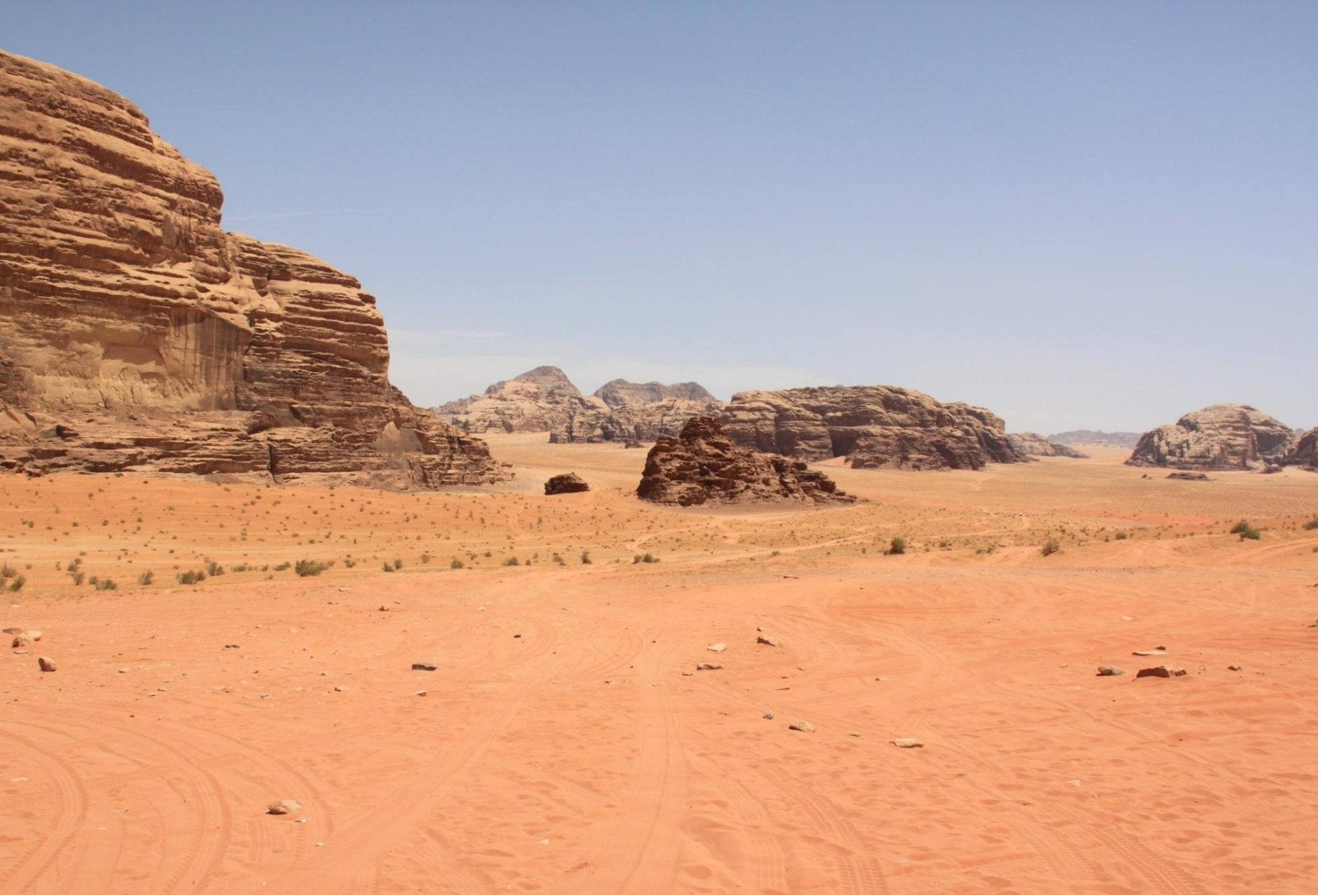
... Wadi Rum desert ...