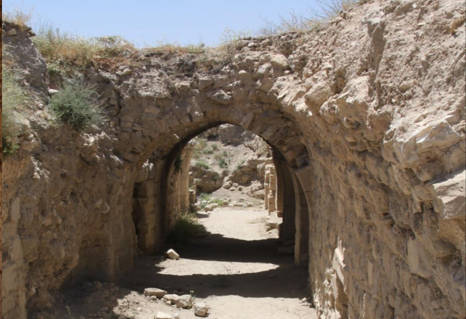
... the crusader castle of Karak ...