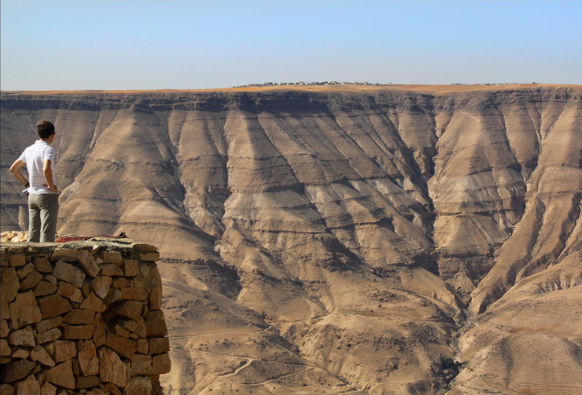
... Wadi Mujib, on our way south along the Kings Highway ...