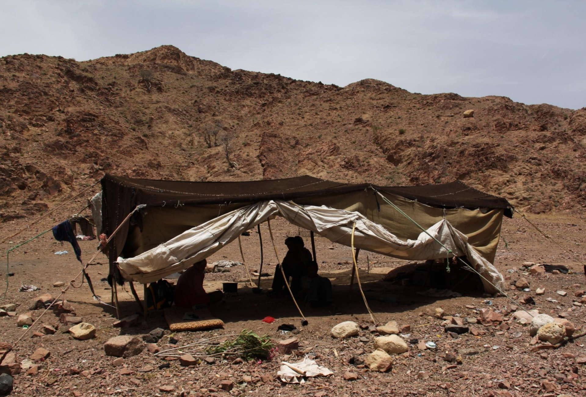
... the first guesthouse along the way ...